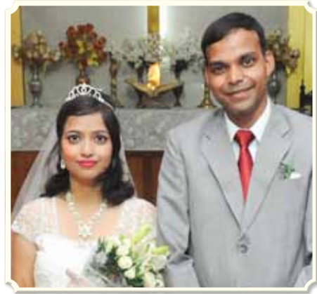
Active & Geeta, India