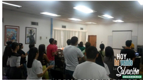
07-16-2016 College of Engineering (LUZ),

College of the Humanities (LUZ), 07-19-2016 Raúl Leoni Borough 07-22-2016