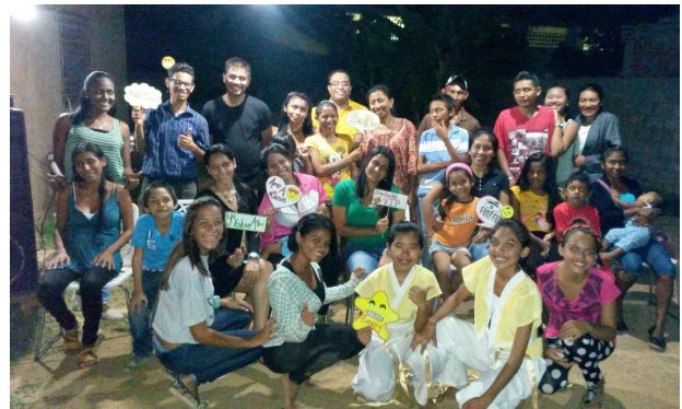
Felipe Hernández Borough, 08-19-2016