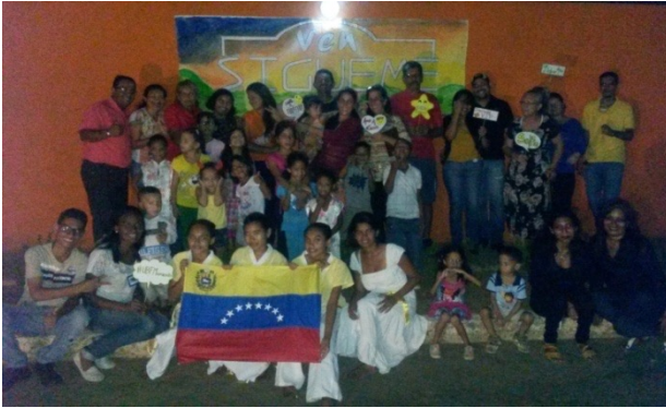
El Soler Borough, 08-05-2016

we titled "Come Follow Me," based on the story of the rich young man. For it, we followed the same methodology mentioned above: a message, praise, dance, music and life testimonies. God gave us a lot of dynamism and practice preparing the previous one; so for this one, we were much better prepared. Unfortunately the University was on its vacation break, so we opted to do the presentations in the communities and chose two: El Soler and Felipe Hernandez. A fellowship had been working in the latter one for several months, so we decided to include it in our agenda.